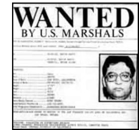
Mitnick's Wanted Poster